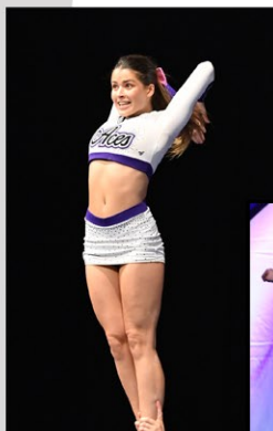
Aces Uniform £230