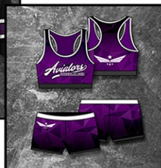
*last season merch and uniforms for example only