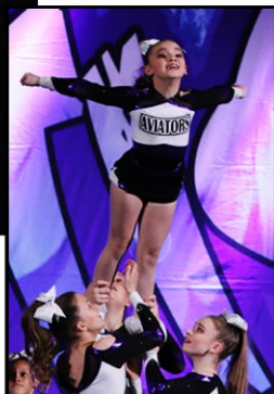
Domestic Uniform Allstar/Elite £185 Novice £110